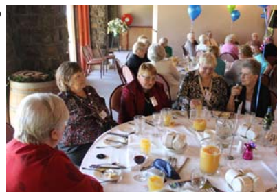
Picture above– At St Annes Winery and left the Titanic Artifact Exhibition.